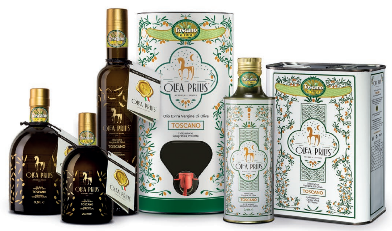
Our Oil is divine, it is strong, it is aromatic, it is earthly it is real!