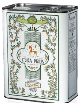
2 x 2000 ml

IGP Tuscan Organic Extra Virgin Olive Oil Recycled metal tins with safety closure cap