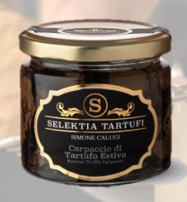
Summer Truffle Carpaccio