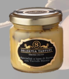
White Truffle Butter