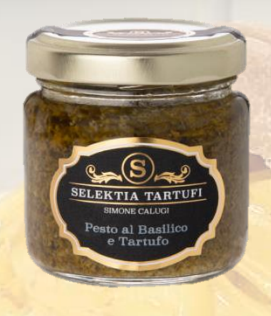
Basil L. Truffle Pesto