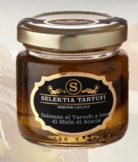
Acacia Truffle Honey